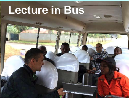
Lecture in Bus