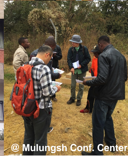
@ Mulungsh Conf. Center