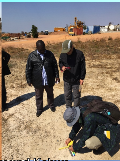
Sampling around Kabwe