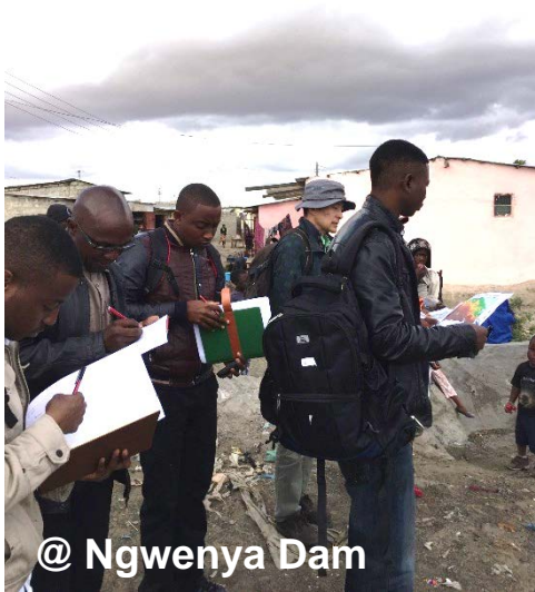
@ Ngwenya Dam