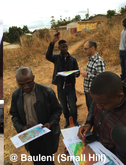
@ Bauleni (Small Hill)