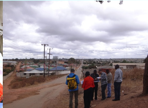
@ Bauleni (Small Hill)