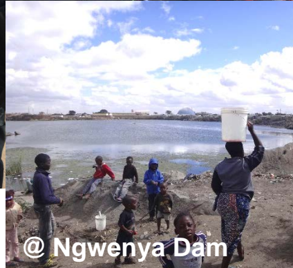
@ Ngwenya Dam