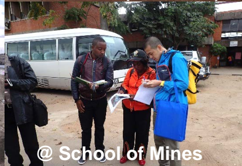
@ School of Mines